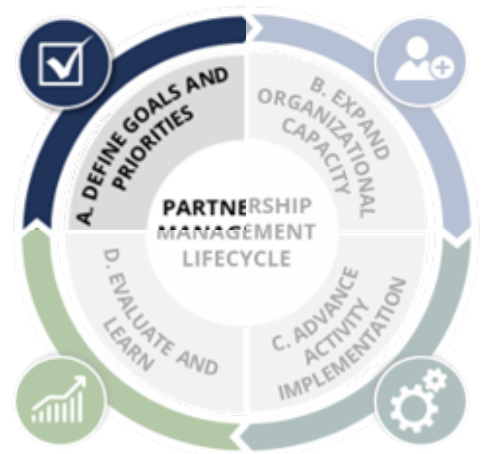
Philadelphia focused on Phase A of the framework. See page 2 for more.

Philadelphia identified a need for support with targeted data collection and analysis to provide insights on their work and shape their program goals. Philadelphia sought to use the framework to build on the activities outlined in their logic model and expand their scope of influence to meet program goals for adult vaccination through non-traditional partnerships . Their focus was on creating more diverse partnerships that were mutually beneficial, including a goal to support more diverse communities, including those experiencing homelessness, those in long term care facilities, and immigrant communities .