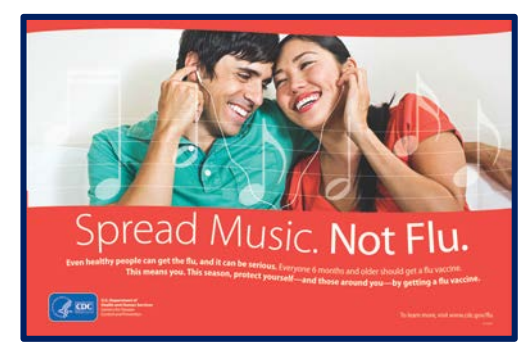
Figure 1: CDC's Spread Music. Not Flu. poster promoting the 2015 flu vaccine to young adults.

Seasonal influenza (flu) can be a serious disease that leads to hospitalization and occasionally death. Every flu season is different because the types and subtypes of influenza viruses can change each year. Although persons with underlying illness are more likely than others to have severe consequences of flu, even otherwise healthy persons can get sick and spread it to others. During 31 flu seasons (1976–2007) estimates of flu-associated annual deaths in the United States range from a low of approximately 3,000 to a high of approximately 49,000 persons dying from a condition associated with flu each year.