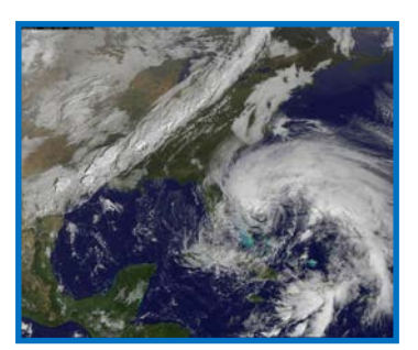
Figure 1: Hurricane Sandy (Atlantic Ocean), Rob Gutro: NASA's Goddard Space Flight Center, Greenbelt, Maryland, October 26, 2012. Image courtesy of Rob Gutro in CDC's Public Health Image Library (PHIL).

A natural disaster is a major event resulting from forces that have catastrophic impact, such as an earthquake, flood, forest fire, hurricane, tornado, or tsunami. The effects of a disaster, terrorist attack, or other public health emergency can be long-lasting, and the resulting trauma can reverberate even among those not directly affected by the disaster. Although knowing that certain types of natural disasters are about to occur might be impossible, being prepared to respond can substantially reduce the consequences and death toll of such events. National emergency preparedness requires a coordinated effort involving every level of government as well as that of private citizens and nongovernmental organizations. After watching a short video introducing students to the Emergency Operations Center at the Centers for Disease Control and Prevention (CDC) in Atlanta, Georgia, students will analyze and interpret data from real-world public health emergency responses and plan a response to a natural disaster in simulated time while considering the roles of public health professionals needed for such a unified response.