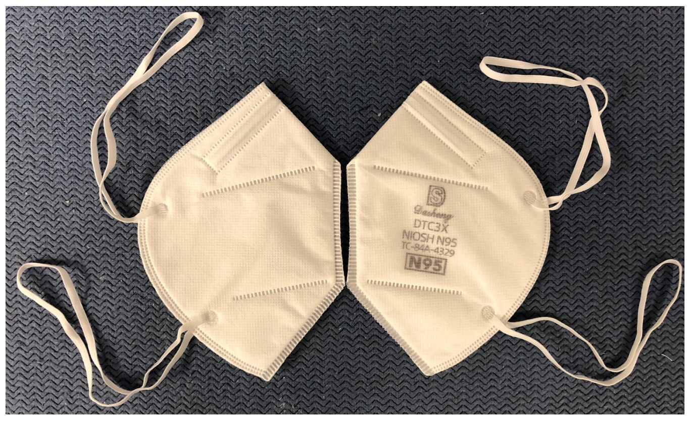
NPPTL COVID-19 Response: International Respirator Assessment