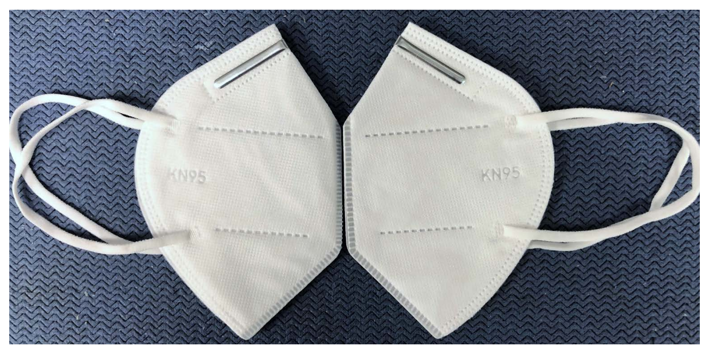
NPPTL COVID-19 Response: International Respirator Assessment