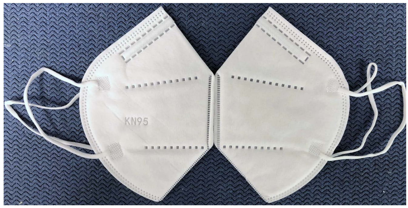
NPPTL COVID-19 Response: International Respirator Assessment