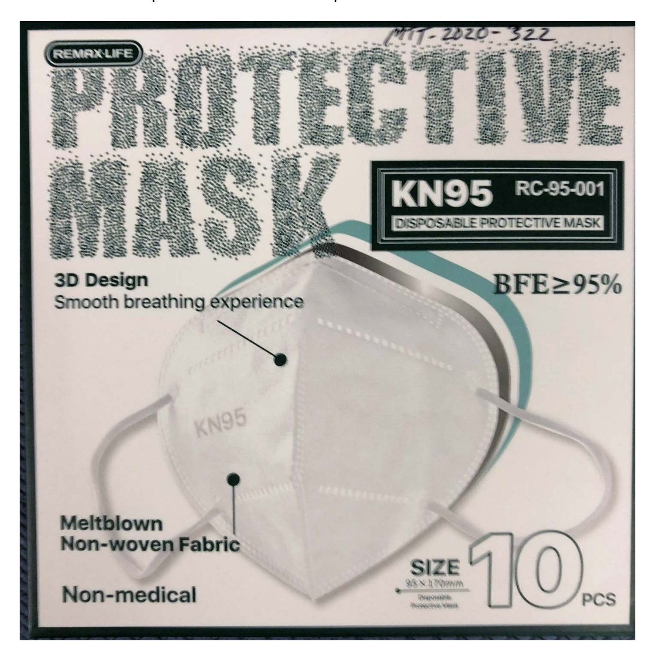
NPPTL COVID-19 Response: International Respirator Assessment