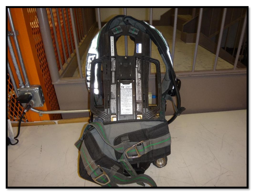
Figure 23: Overview of backframe, waist belt, straps, and buckles