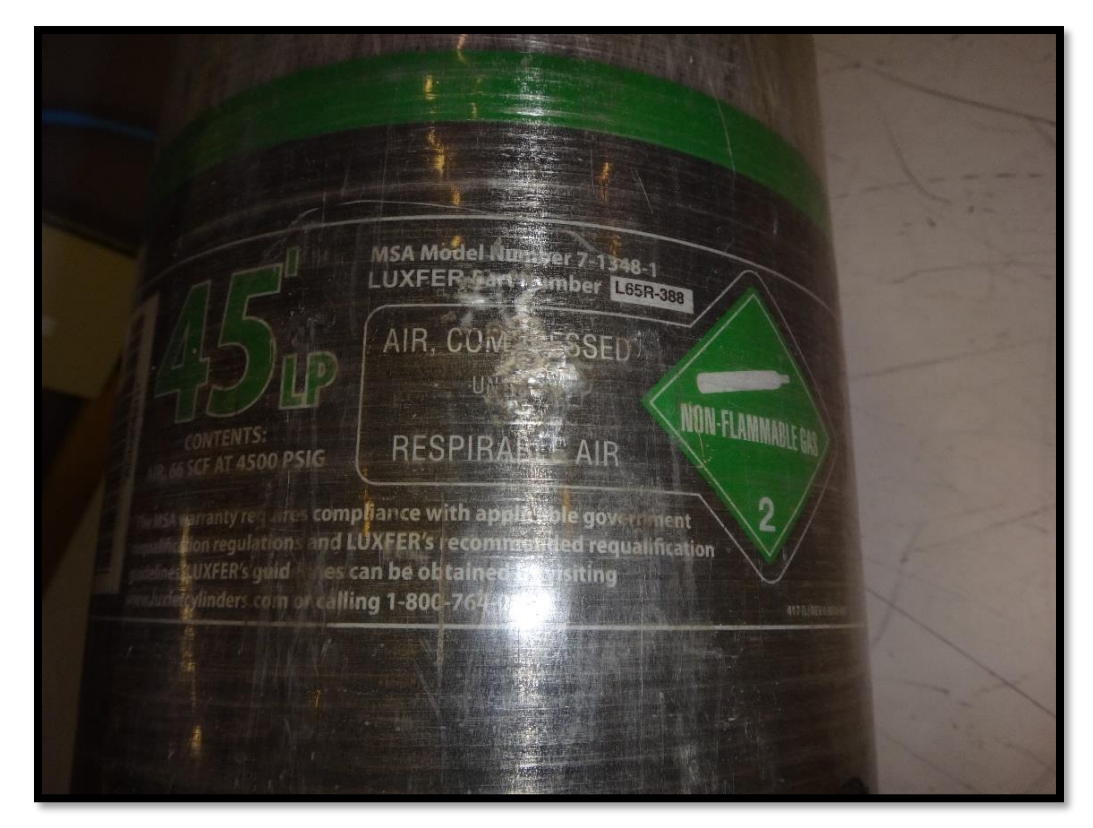
Figure 27: Top view of cylinder with labeling