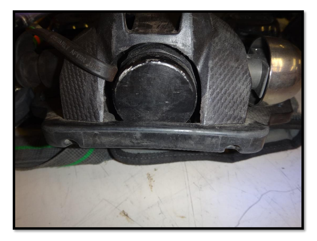
Figure 10: Pressure reducer, RIC UAC with primary low-pressure warning device (bell)