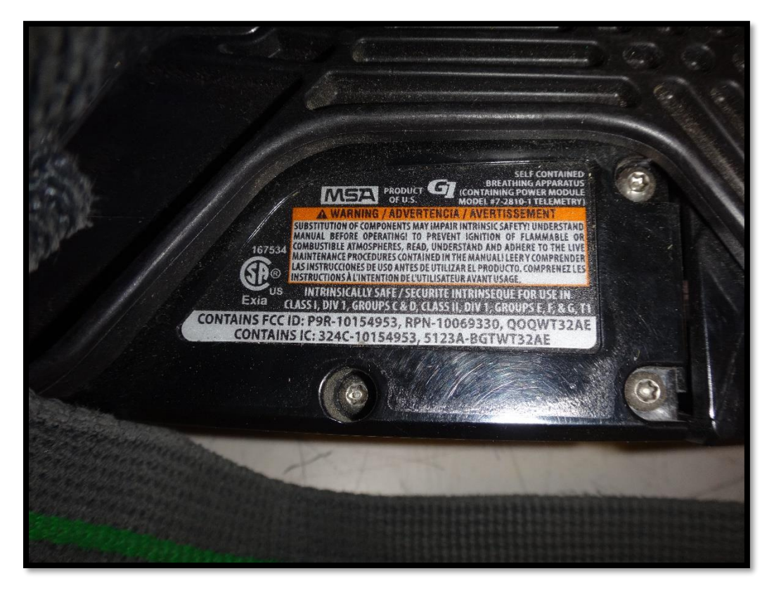
Figure 21: Power module MSA label