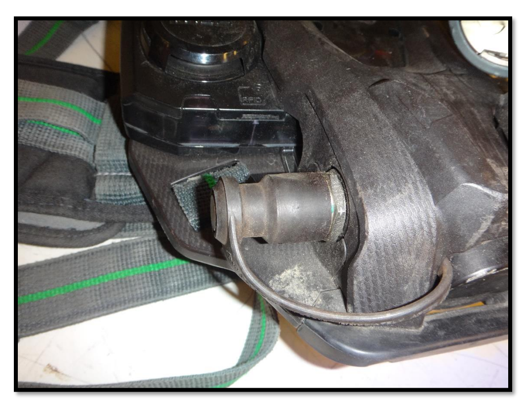
Figure 17: Quick Connect adapter cover