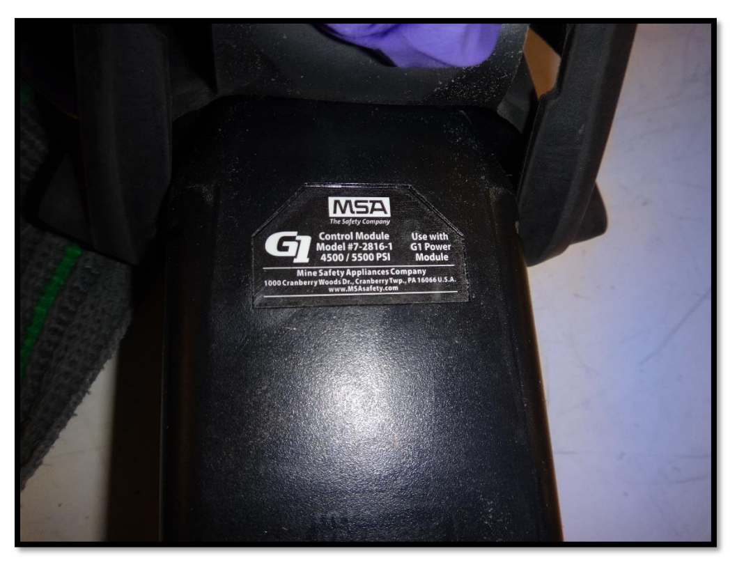
Figure 14: Labeling on PASS control module