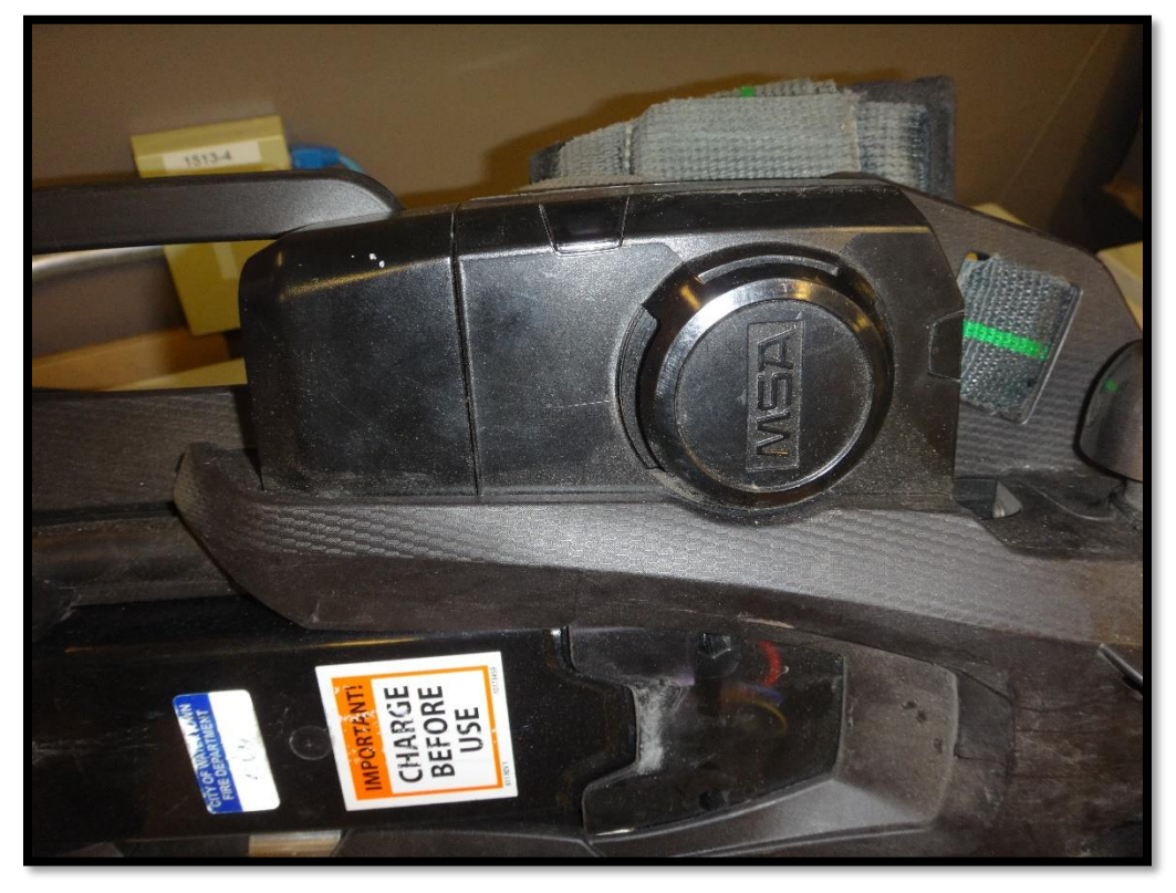
Figure 20: Power module