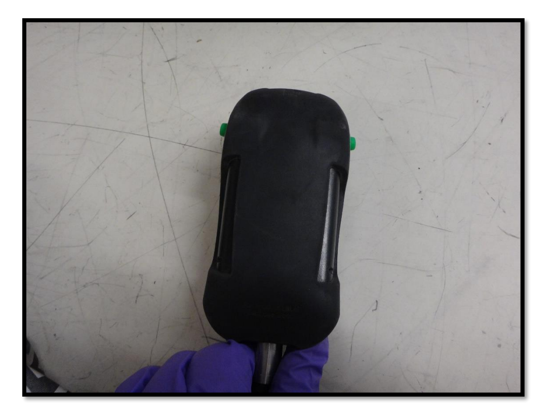
Figure 13: Back of PASS control module