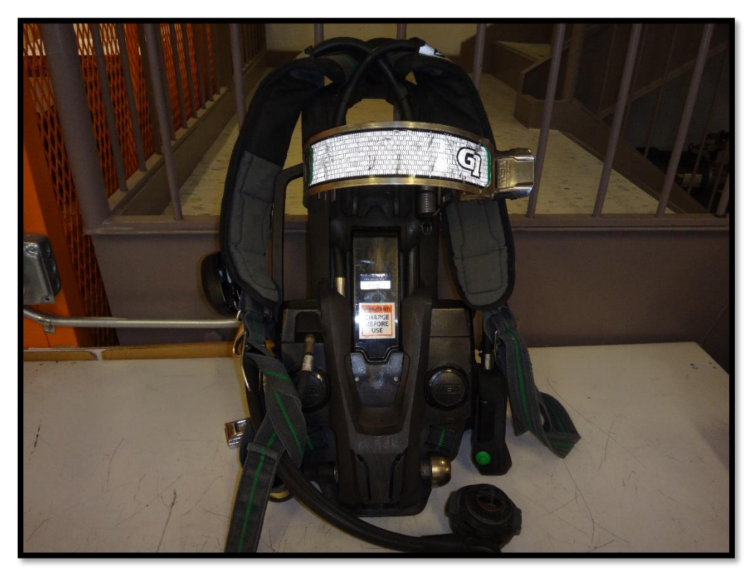
Figure 25: Backframe with cylinder holder