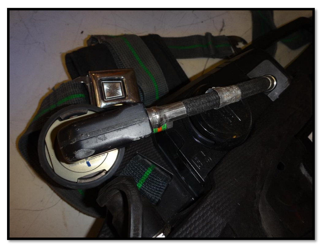
Figure 16: Top view of high-pressure hose