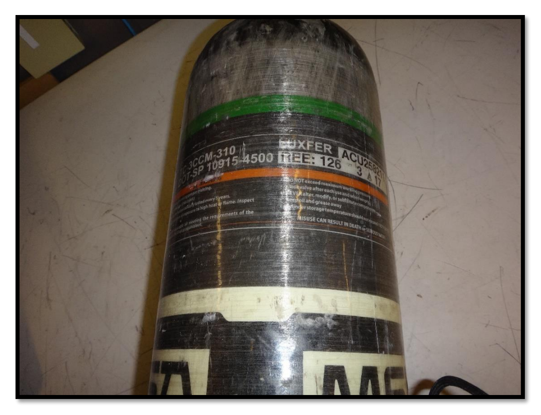
Figure 26: Top view of cylinder with labeling