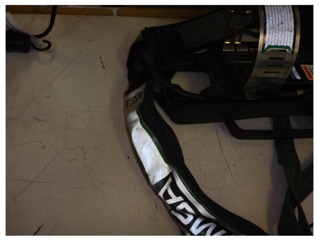
Figure 9: Low-pressure line in protective sleeve