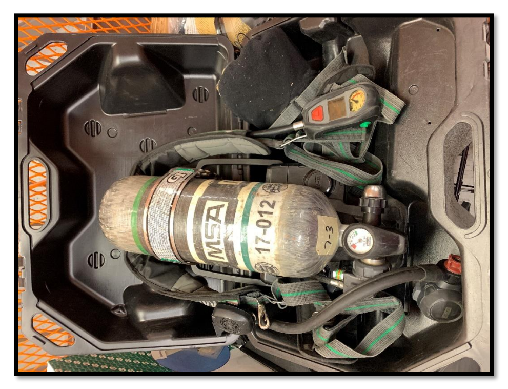
Figure 1: SCBA as received