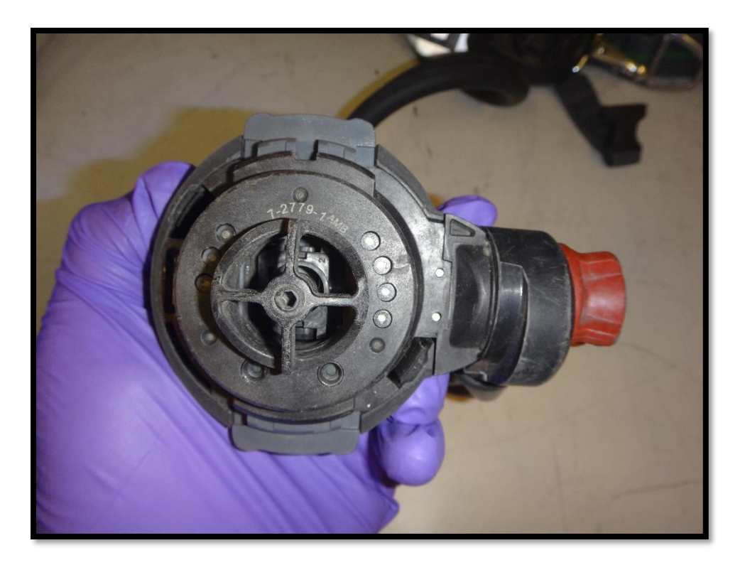
Figure 7: Inside of mask-mounted regulator