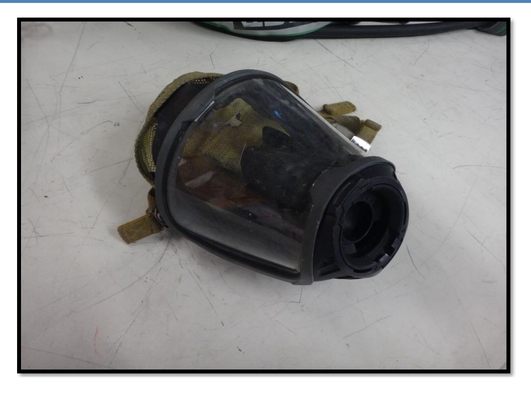
Figure 2: Front of facepiece