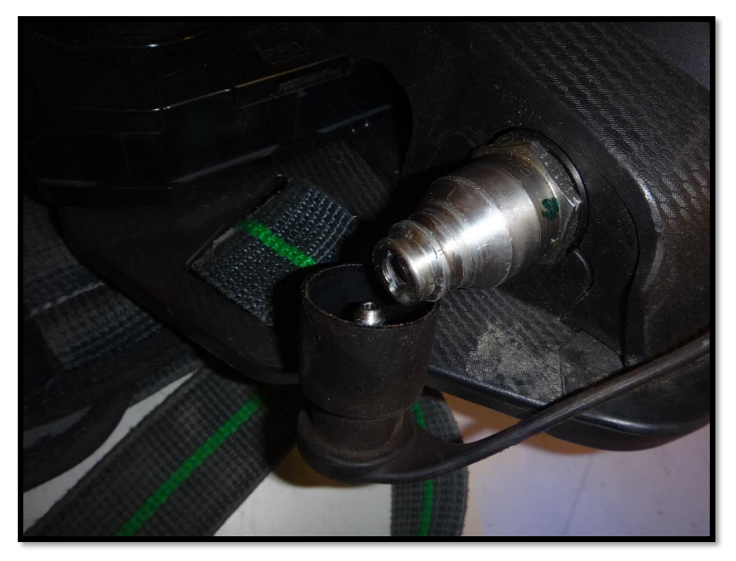
Figure 18: Quick Connect adapter