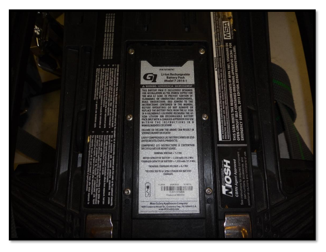
Figure 22: Back of backframe with labels