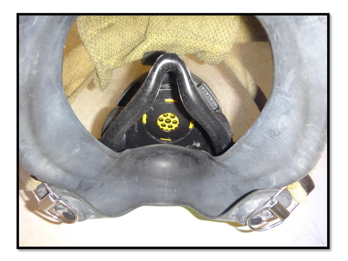
Figure 3: Inside facepiece and HUD