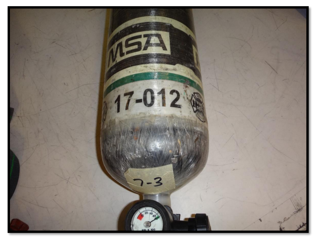
Figure 28: Top view of cylinder with labeling