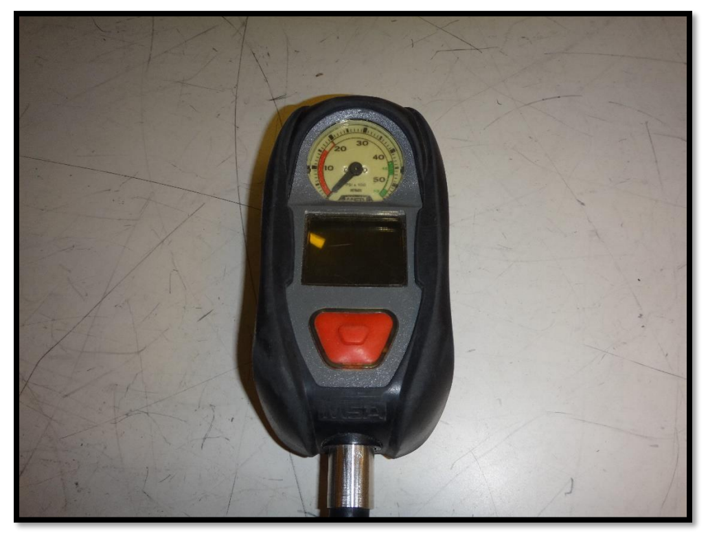
Figure 12: Front of PASS control module