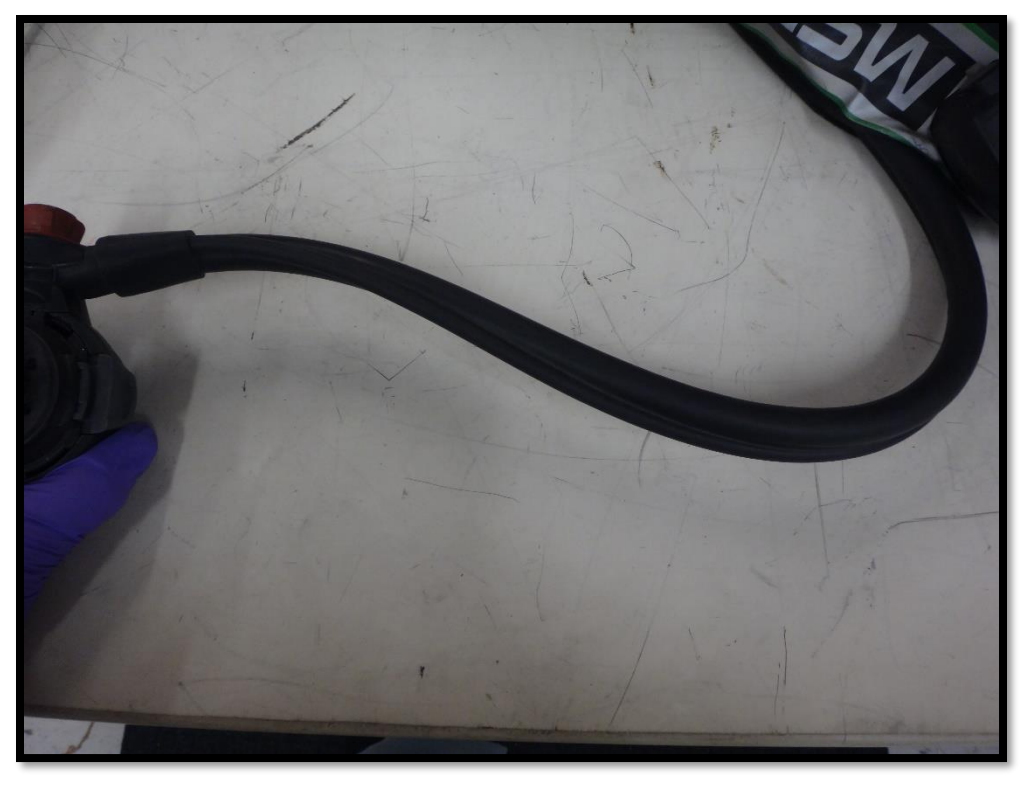
Figure 8: Mask-mounted regulator and low-pressure line connected to SCBA