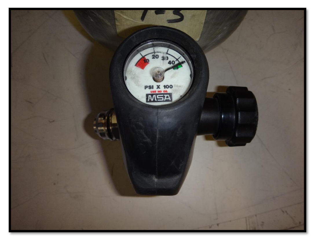
Figure 29: Cylinder gauge