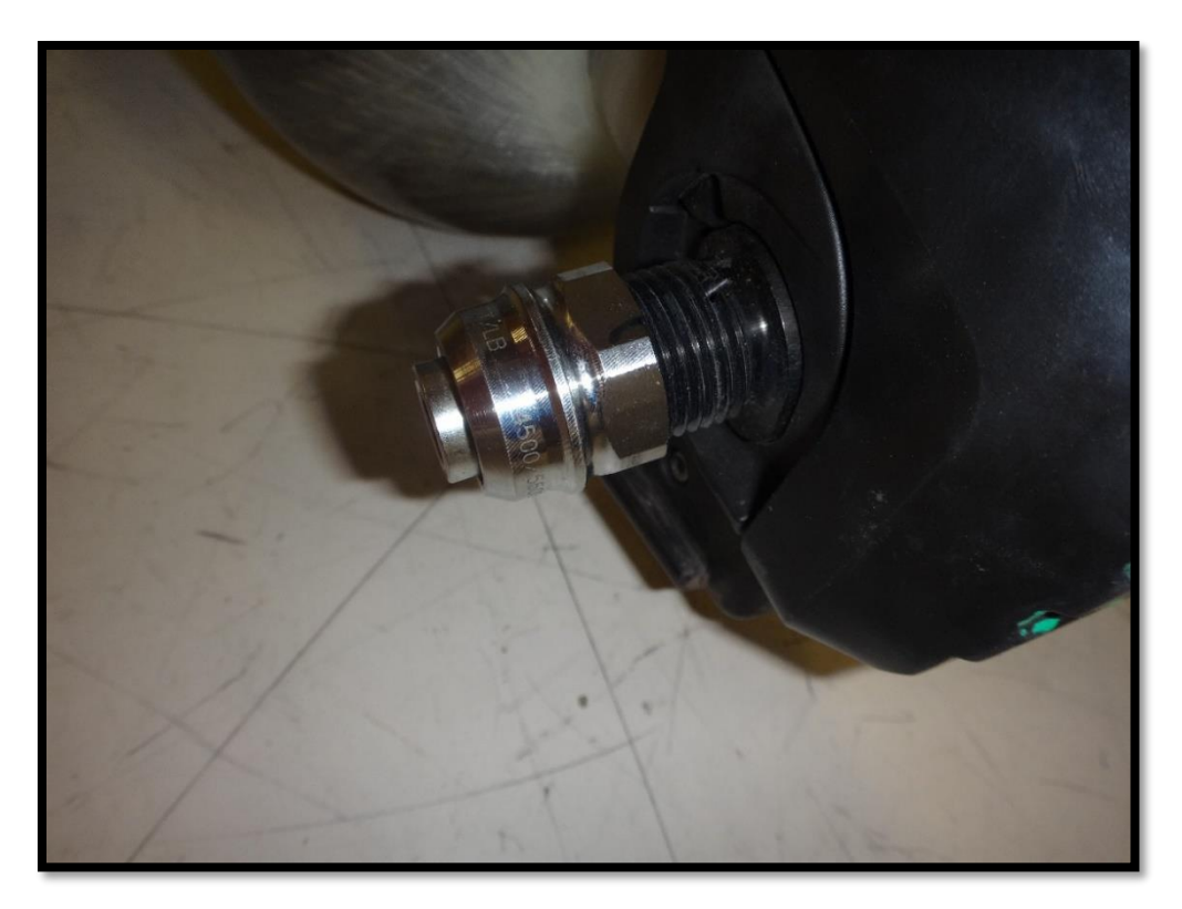
Figure 31: Threaded CGA connector attached to cylinder