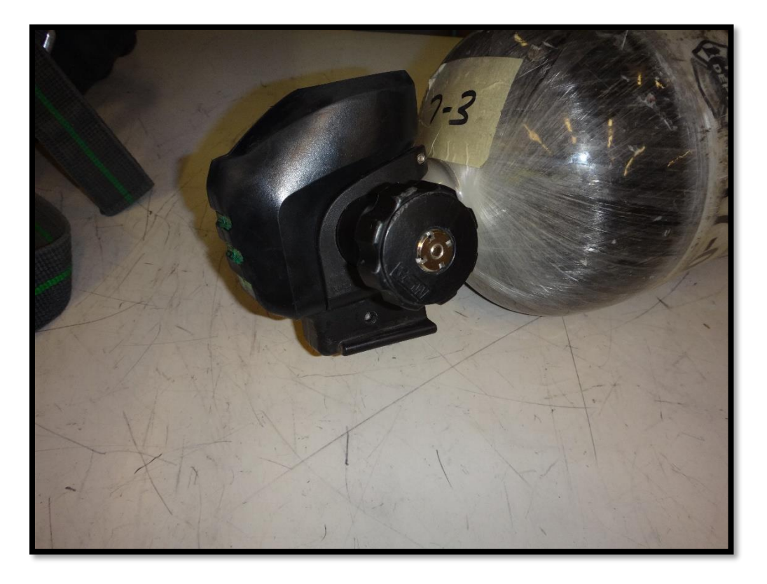
Figure 30: Cylinder valve and rubber bumper