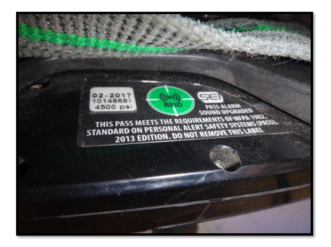
Figure 19: PASS power module SEI label