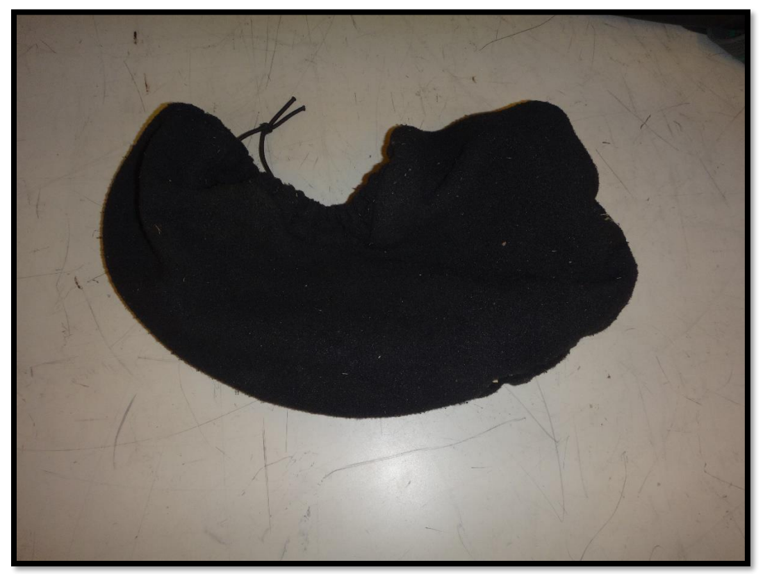
Figure 5: Blackout cover for facepiece