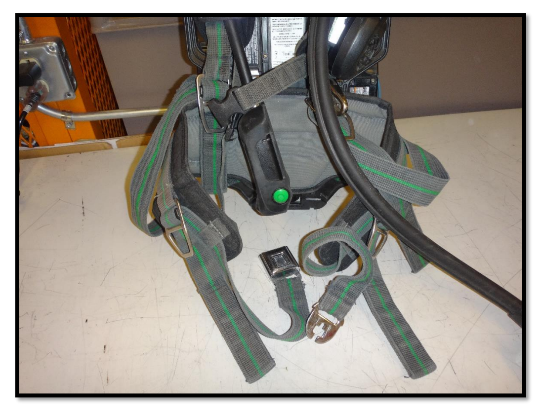
Figure 24: Overview of waist belt, straps, and buckles