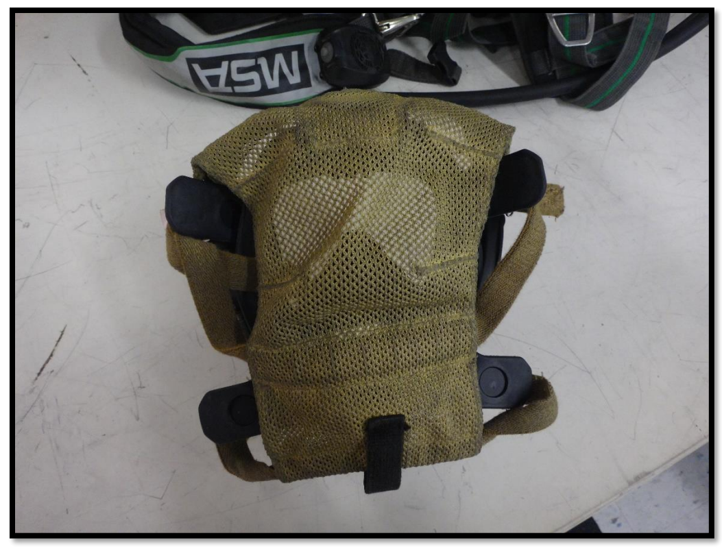
Figure 4: Facepiece hairnet and straps