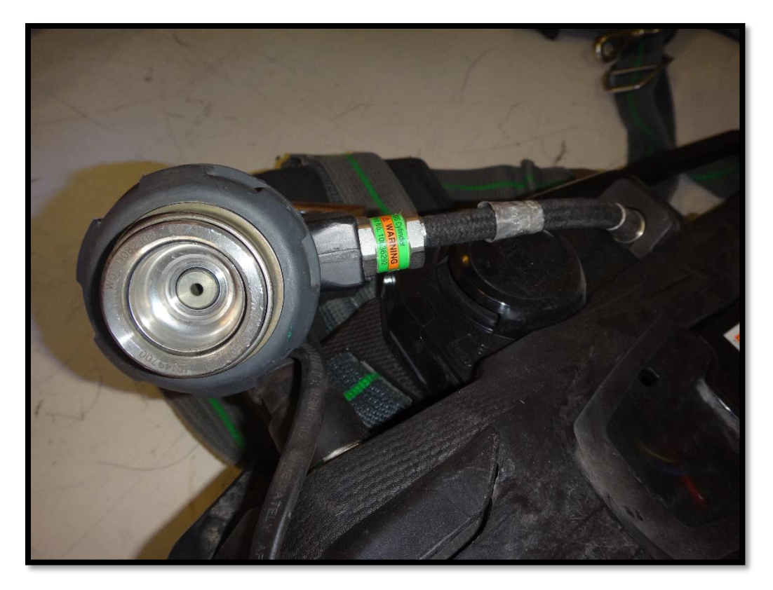
Figure 15: High-pressure hose and cylinder attachment