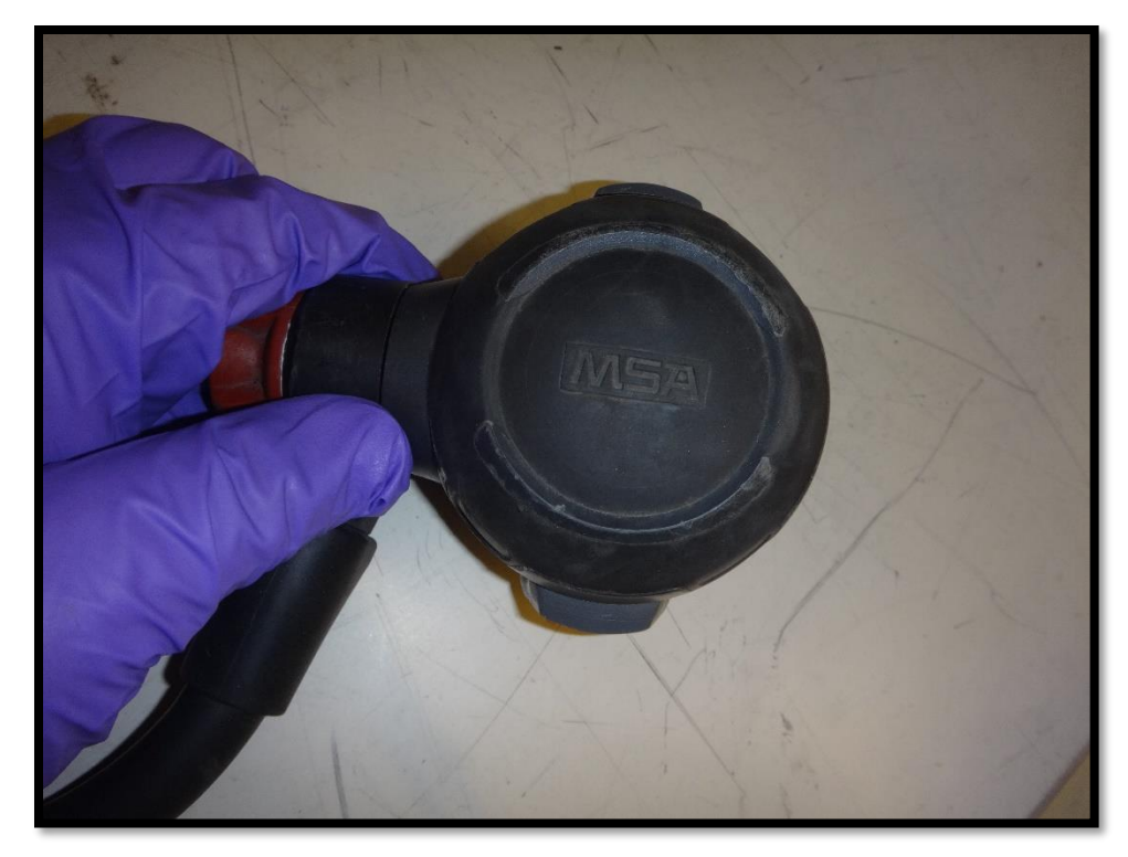
Figure 6: Mask-mounted regulator