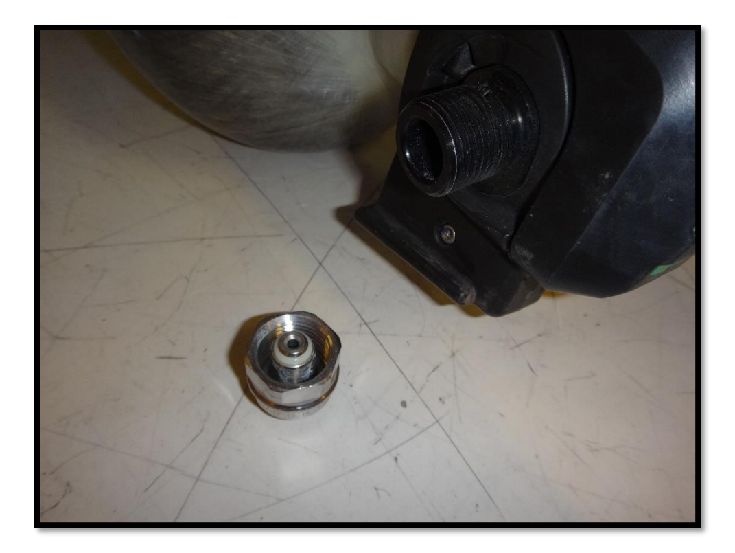
Figure 32: Threaded CGA connector removed to show cylinder threads