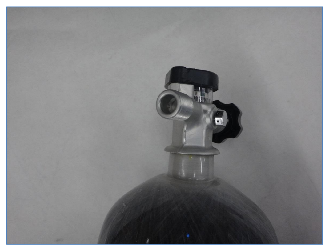
Figure 31: Cylinder threads.