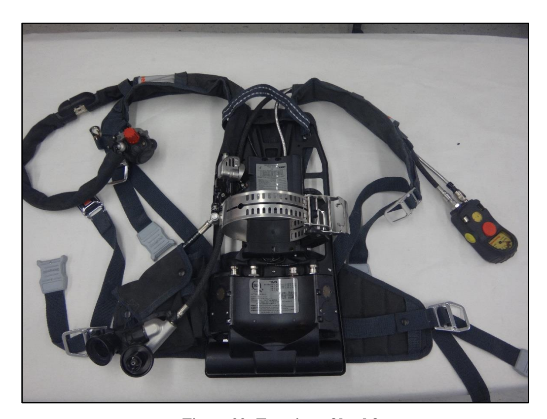
Figure 22: Top view of backframe.