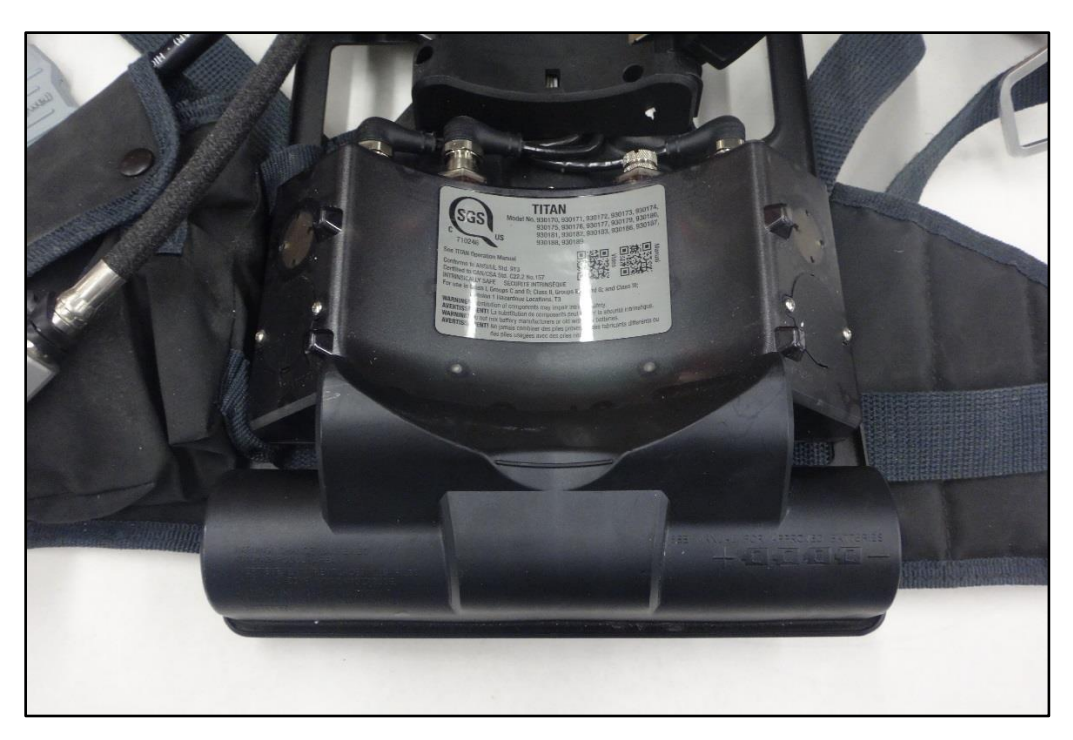
Figure 21: PASS control module.