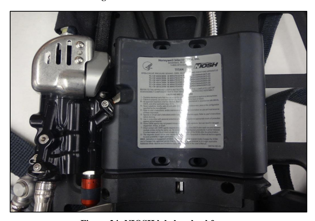
Figure 24: NIOSH label on backframe.