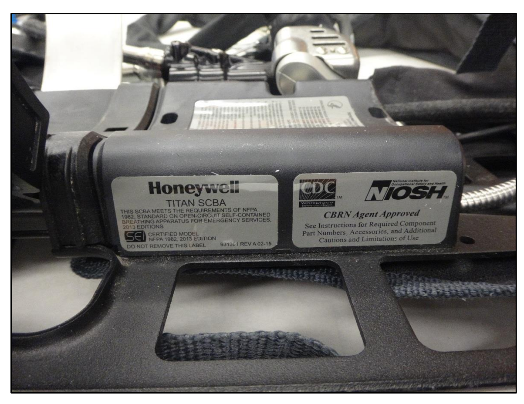
Figure 23: Labels on backframe.