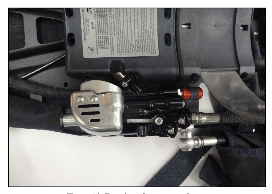
Figure 14: Top view of pressure reducer.