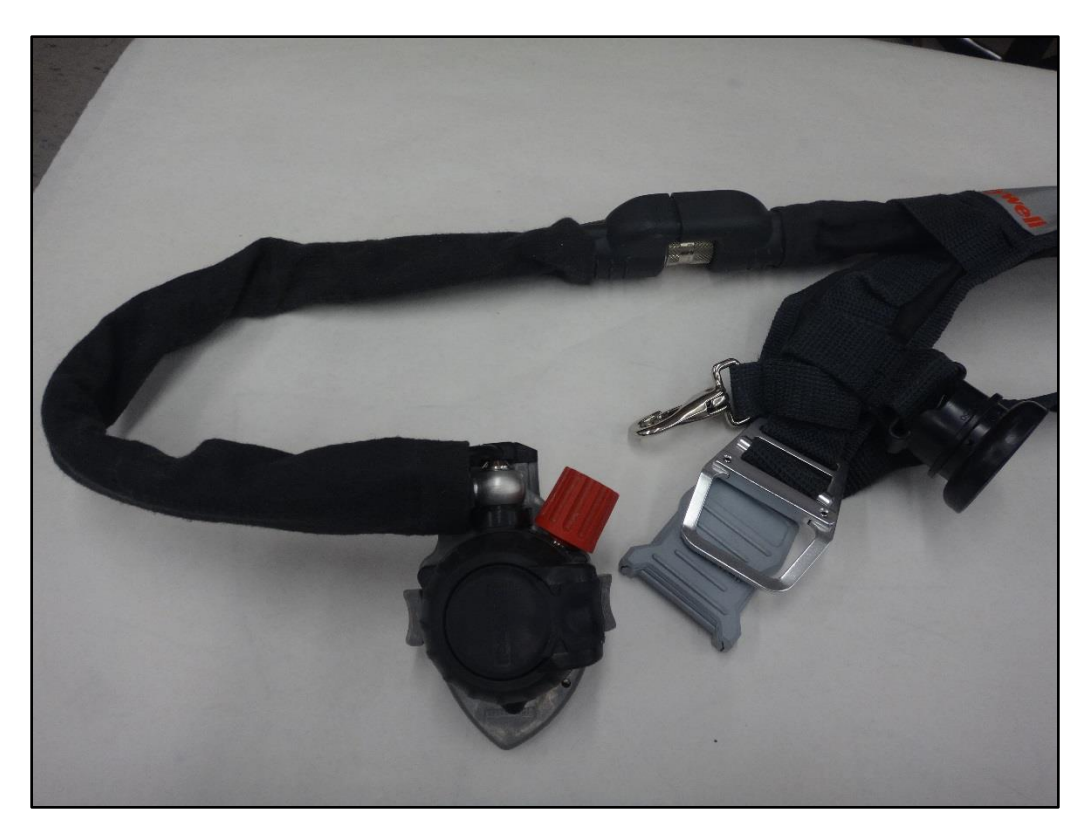
Figure 11: Low pressure line.