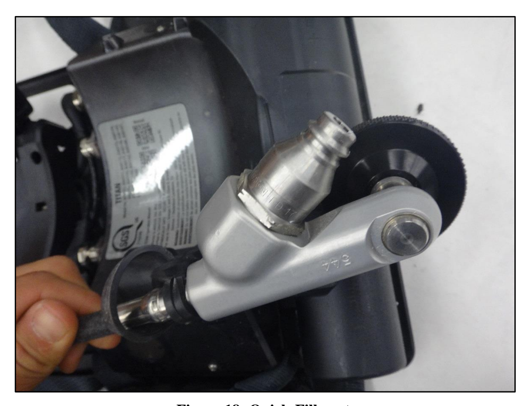
Figure 18: Quick-Fill port.