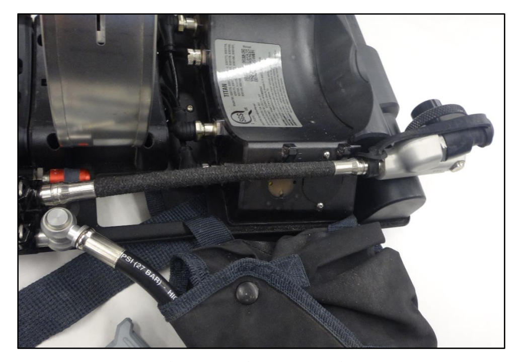
Figure 16: High pressure line.