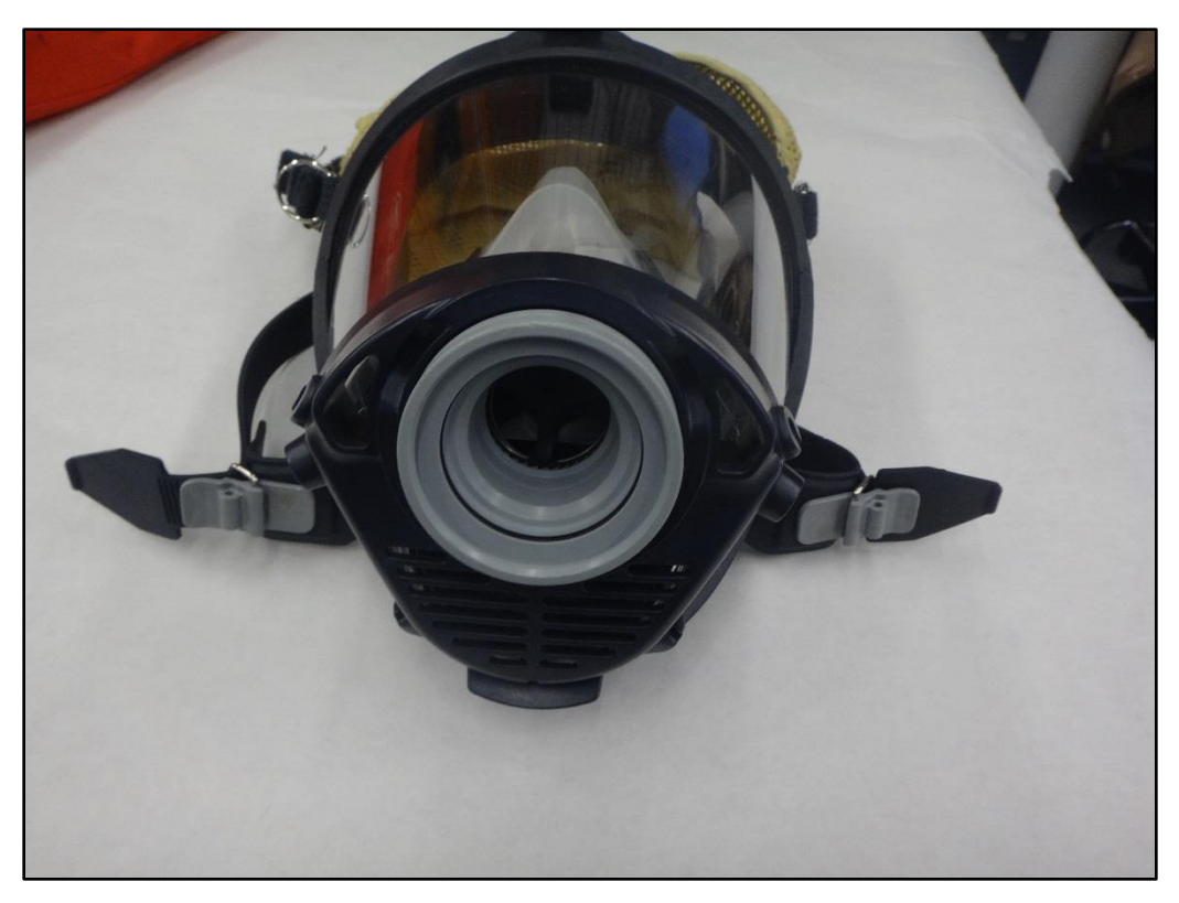
Figure 7: Bottom view of facepiece.