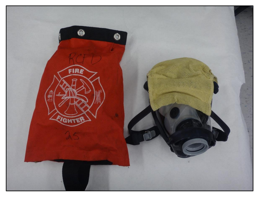
Figure 4: Facepiece out of bag.