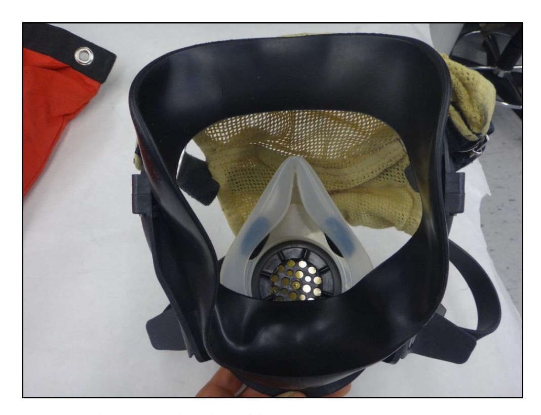
Figure 6: Inside view of facepiece, skirt, and nosecup.