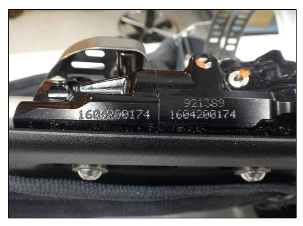
Figure 15: Side view of pressure reducer with markings.