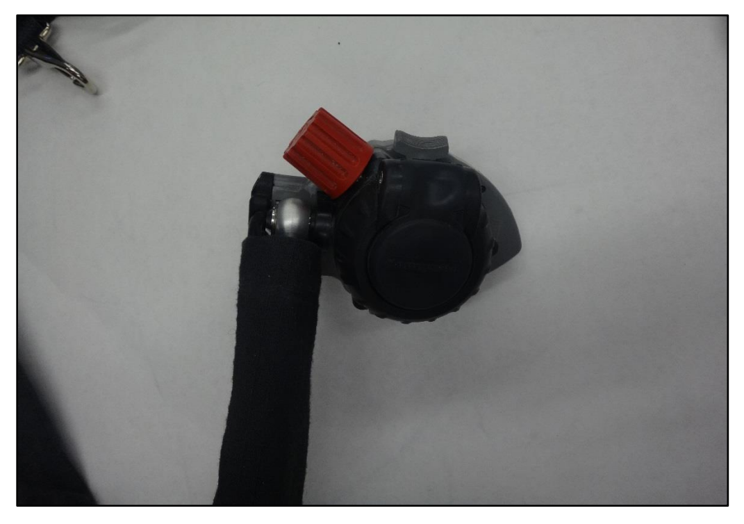
Figure 8: Top view of MMR.