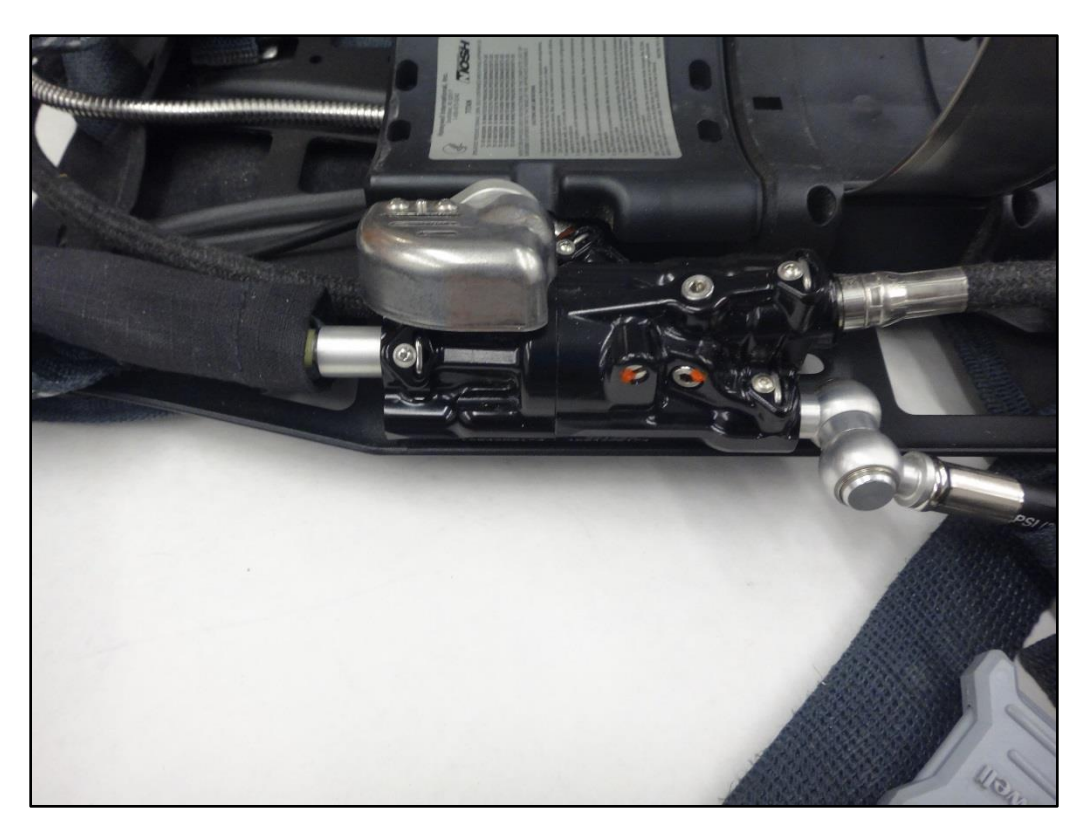
Figure 13: Pressure reducer assembly.