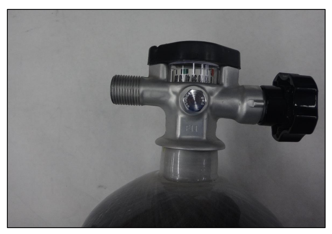
Figure 30: Cylinder gauge and threads.