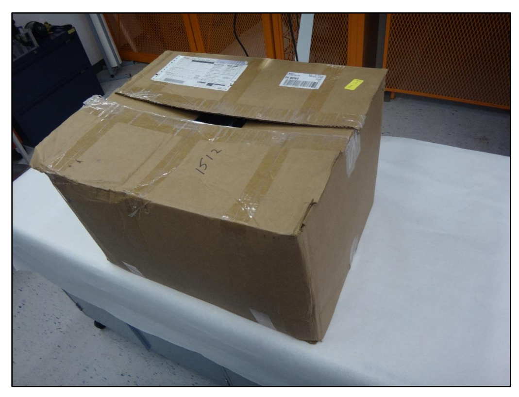
Figure 1: Cardboard box containing SCBA as received.