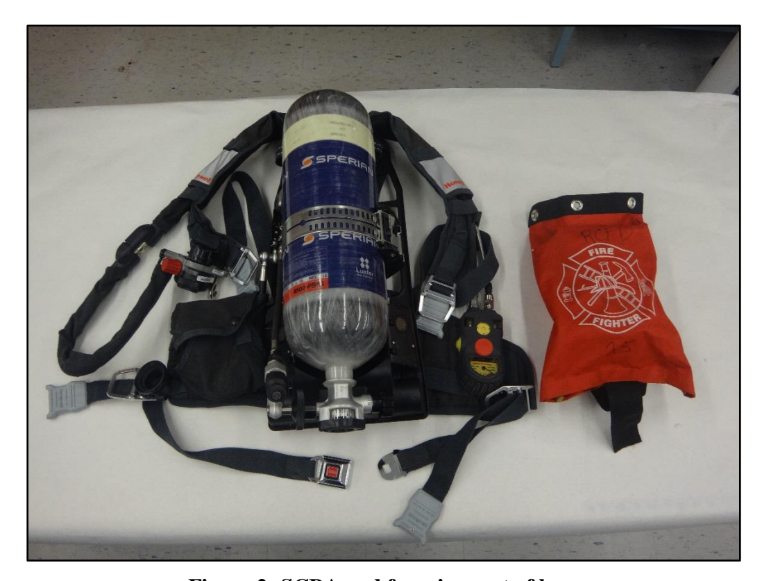
Figure 2: SCBA and facepiece out of box.