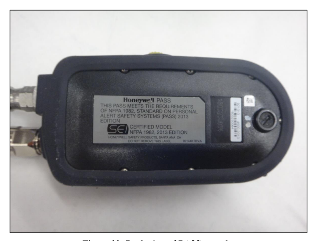
Figure 20: Back view of PASS console.