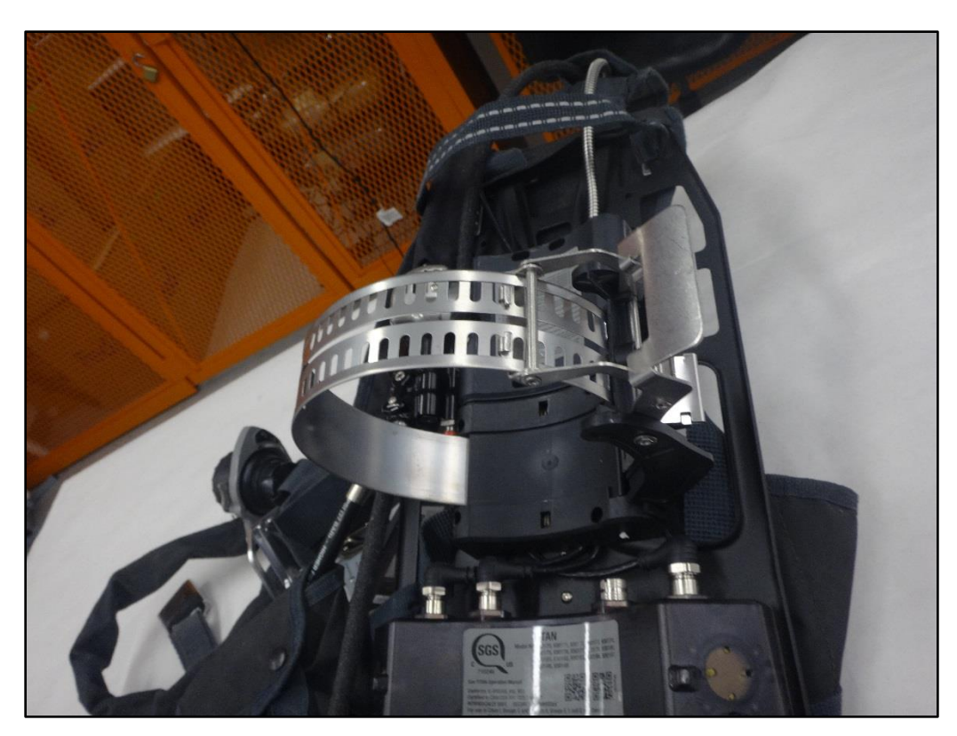
Figure 26: Cylinder strap.