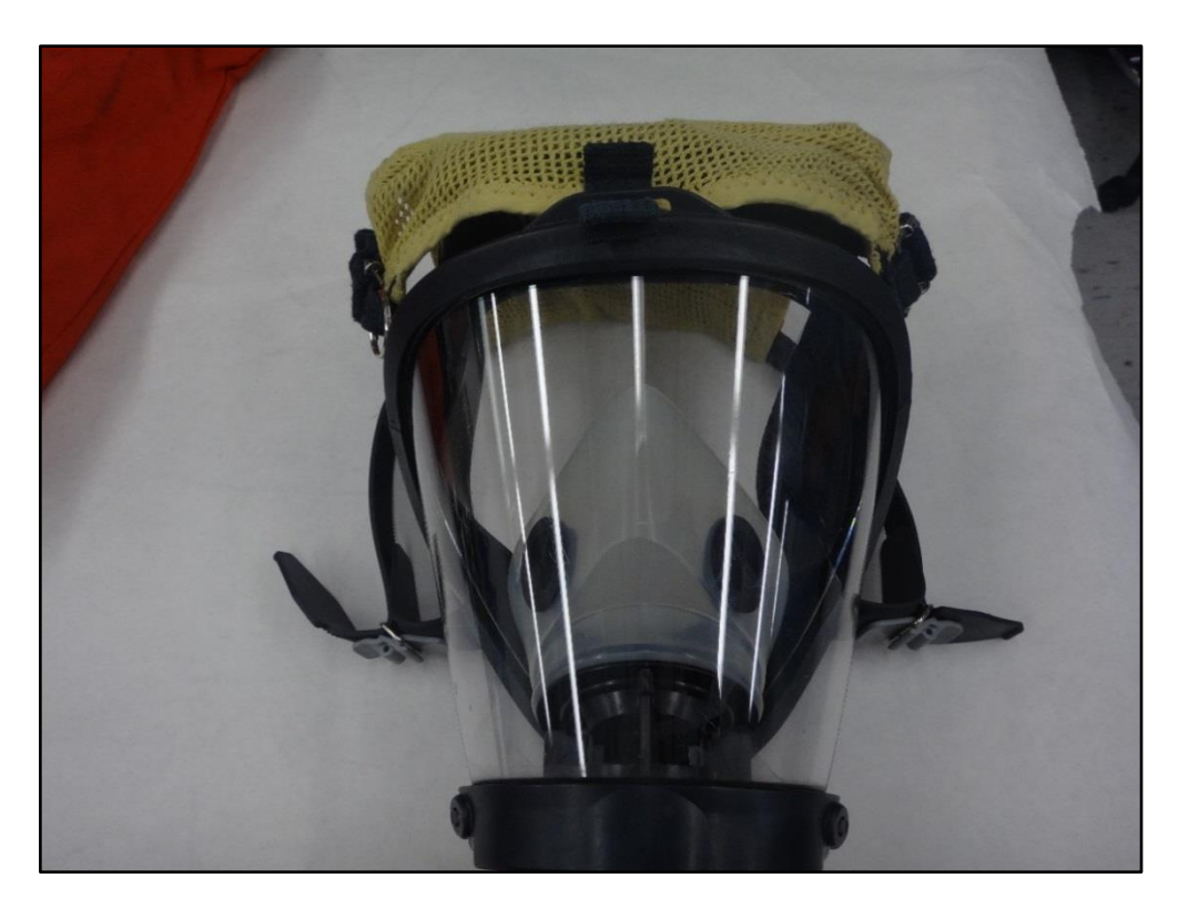
Figure 5: Top view of facepiece.