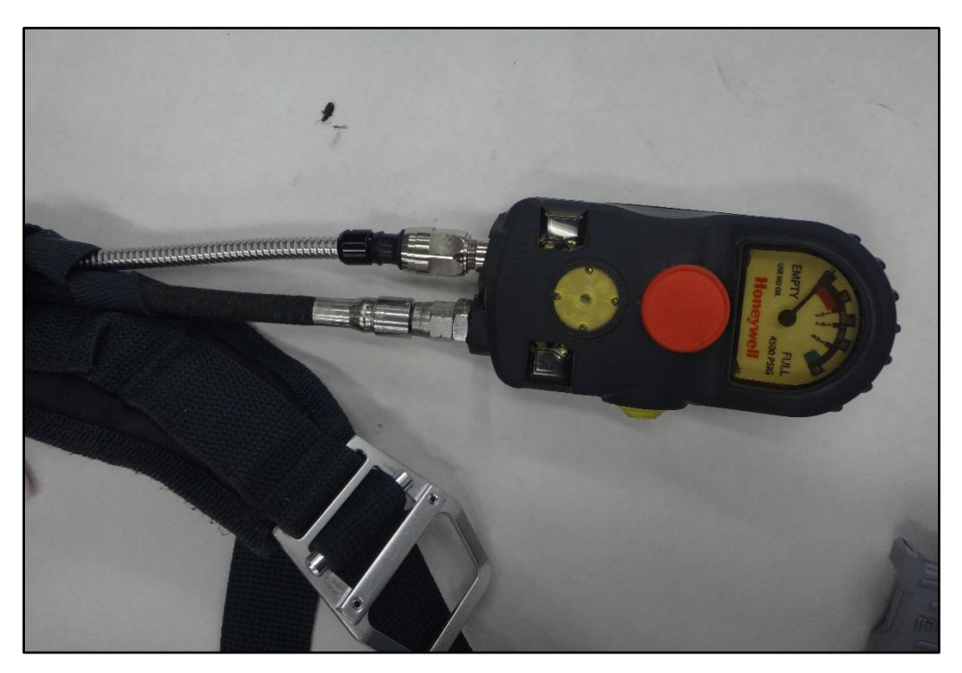
Figure 19: PASS console.