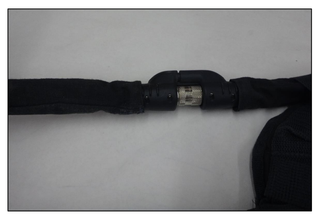
Figure 12: Quick Disconnect on low pressure line.