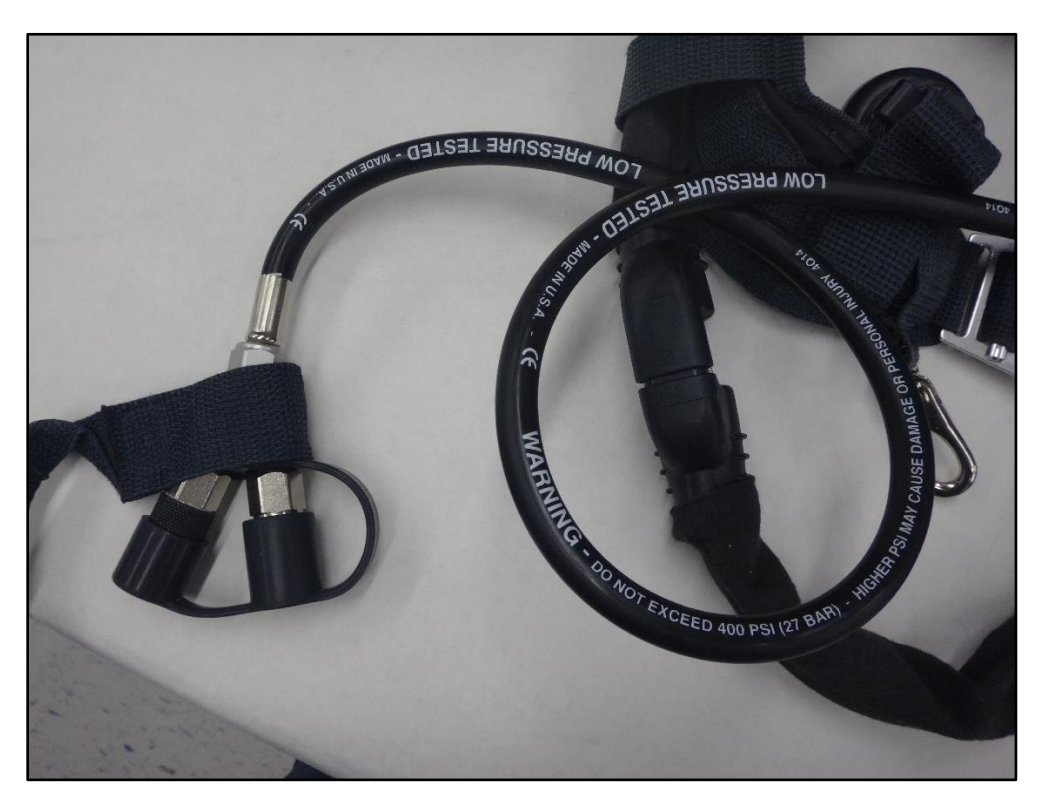
Figure 27: Auxiliary hose out of pouch.