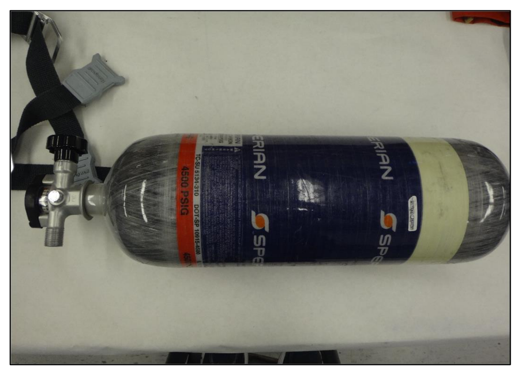
Figure 28: Top view of cylinder.