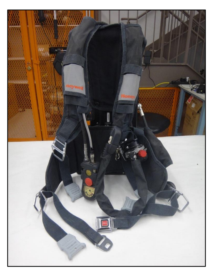
Figure 25: View of all straps and buckles.