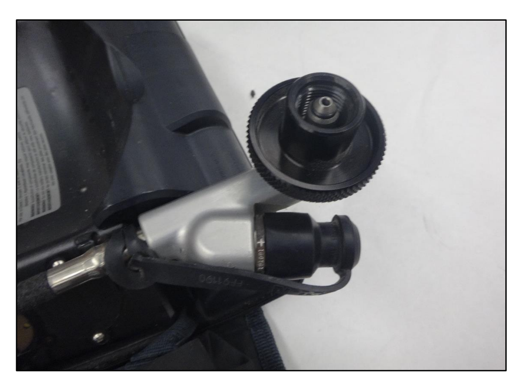
Figure 17: Cylinder attachment and threads.