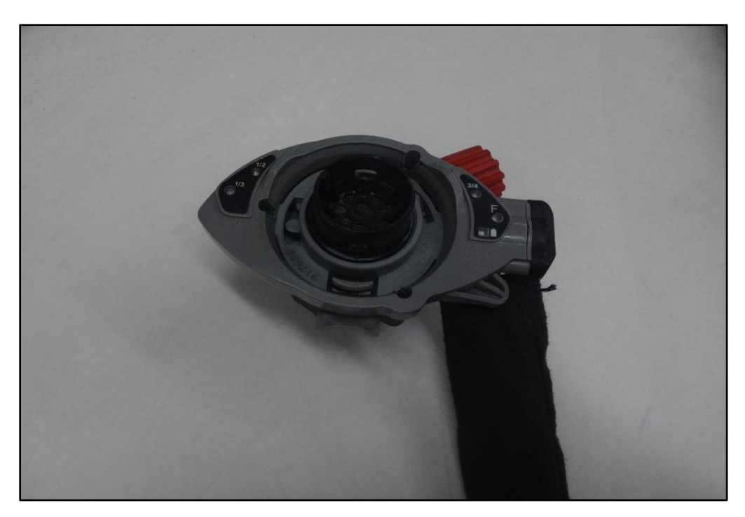
Figure 9: Bottom view of MMR.