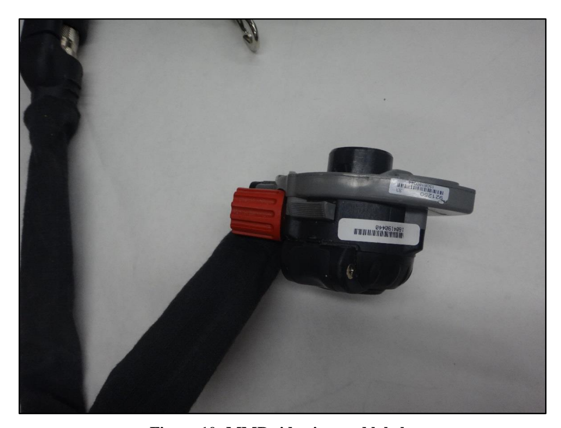
Figure 10: MMR side view and labels.