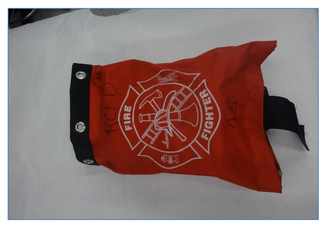
Figure 3: Facepiece in bag.