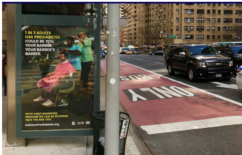
Manhattan, New York, January 2019

Accessible Link: https://www.cdc.gov/diabetes/campaigns/national-prediabetes-awareness-campaign/do-i-have-prediabetes.html