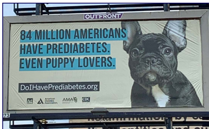
Downtown Atlanta, Georgia, May 2019

The campaign is ongoing because prediabetes remains a significant public health concern. Its messages are designed to reach all US adults aged 40 to 65, with a special focus on communities most affected by diabetes, including Black, Hispanic or Latino, and male populations.